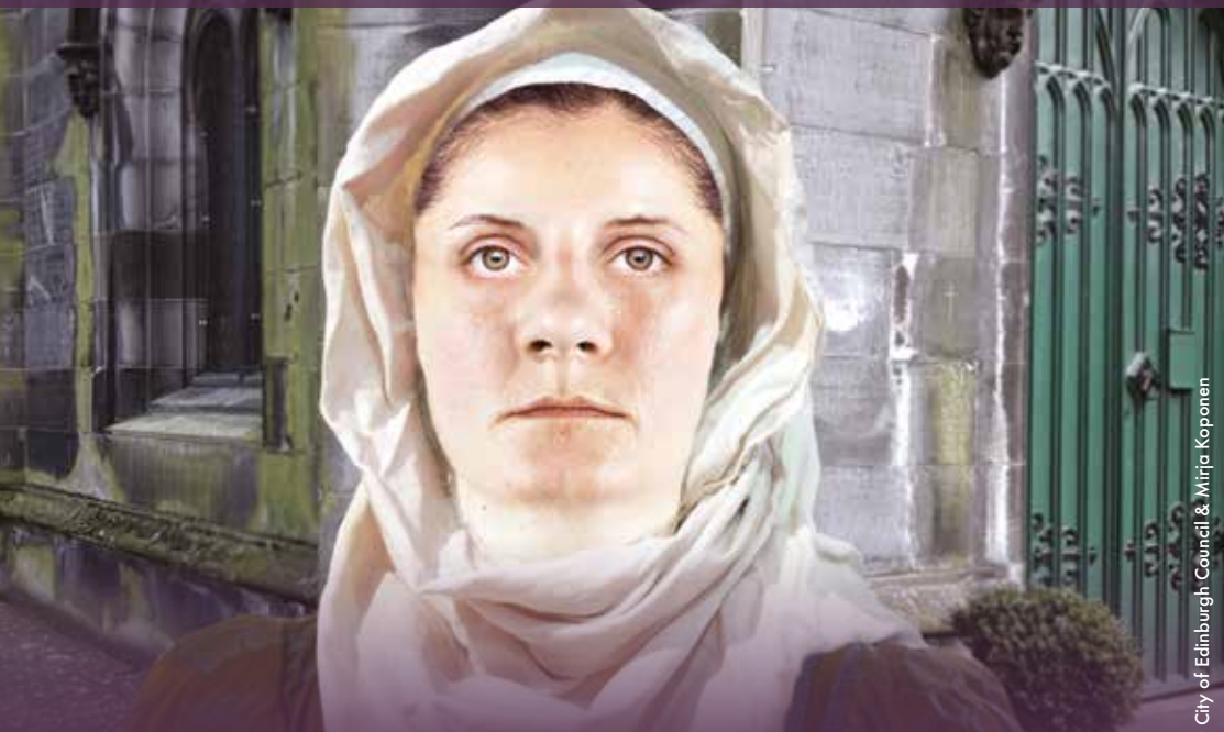
© City of Edinburgh Council & Mirja Koponen

Tickets available online, booking essential as only limited numbers available on the day