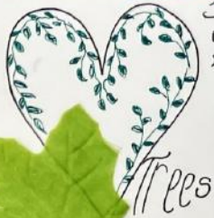
Photo of thorn leaves

I was fascinated you very early on we would often walk locally to see thorn and collect their leaves.